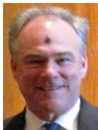
Tim Kaine U.S. Senator from Virginia